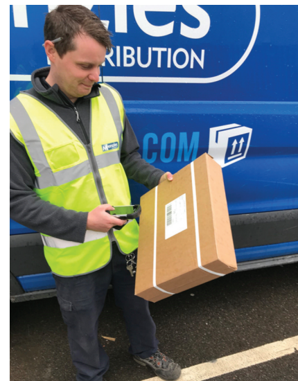
Single scanner used for all carriers